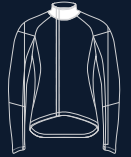
WIND PROOF JACKET